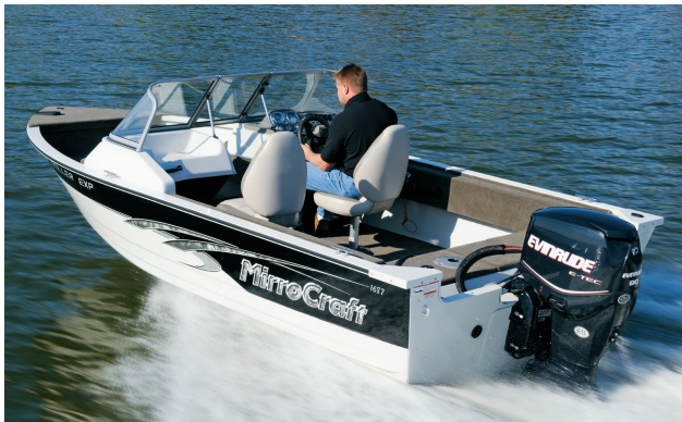
1687 Troller shown

The Troller series gains a new 85" wide 16' model, the 1686 tiller. Along with its' sister craft, the 1685, they continue to cover the performance and value equation. Both of these fine boats offer a long list of standard fishing features that would make any serious fisherman happy. Both models offer great performing V hulls with molded-in spray rails for a dry ride and truly great handling. When powered with midrange powered outboards they offer impressive performance and handling. These wide bodied craft are probably the best overall values in fishing boats on the market.